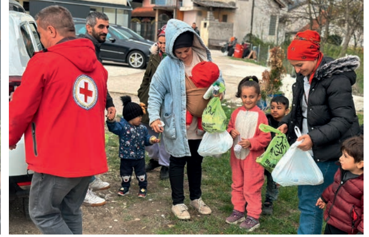
Bihać, Bosnia-Herzegovina, fall 2023: Practical help for people on the flight. In cooperation with the Red Cross in Bihać and the Baptist church in Sarajevo, we continue to help those in need on the Balkan route with food, hygiene products, shoes and clothing.

Cordial invitation to our jubilee celebration of 30 years Hilfe konkret e.V. and 100 years Diakonisches Werk on Friday, December 8, 2023, at 5 p.m. (pre-program including coffee and music starting at 4 p.m.) in Luther-Melanchthon-Gemeinde, 76227 Karlsruhe-Durlach, Bilfinger Straße 5. RSVP to johannes.neudeck@gmx.de or 0172-6205250 or spontaneous participation.