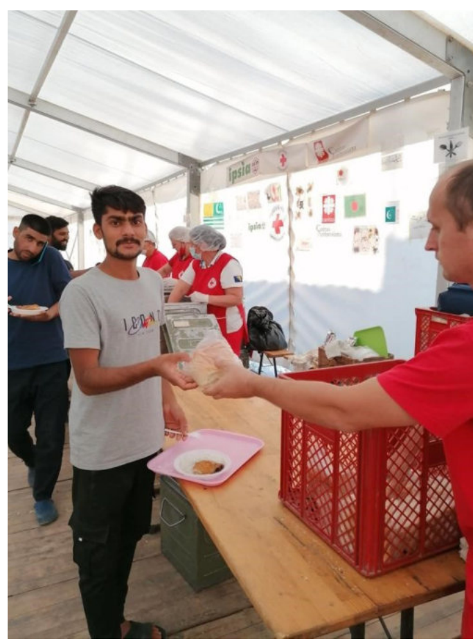
Handing out meals in the camp Lipa