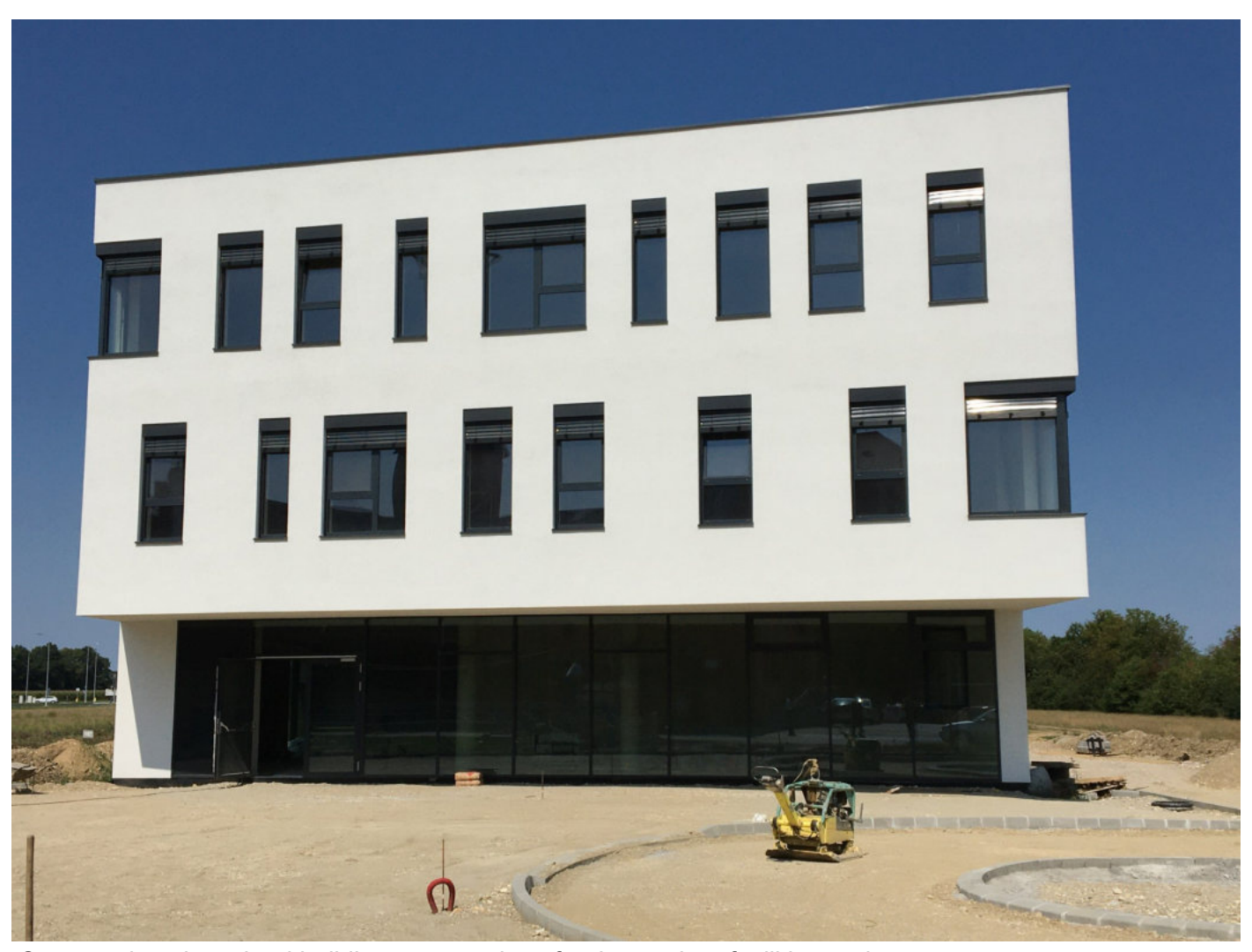
Construction site school building: preparations for the outdoor facilities and entranceways