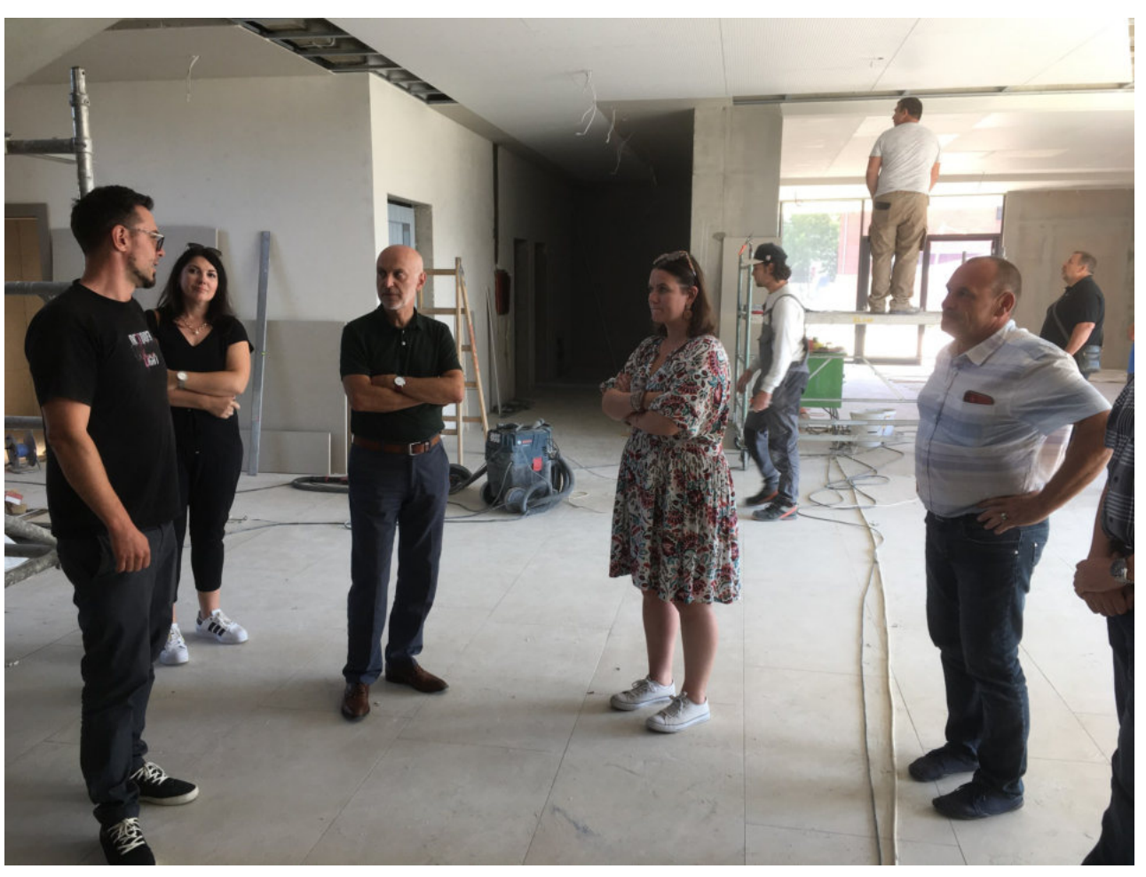
Visiting the entry of the new school building