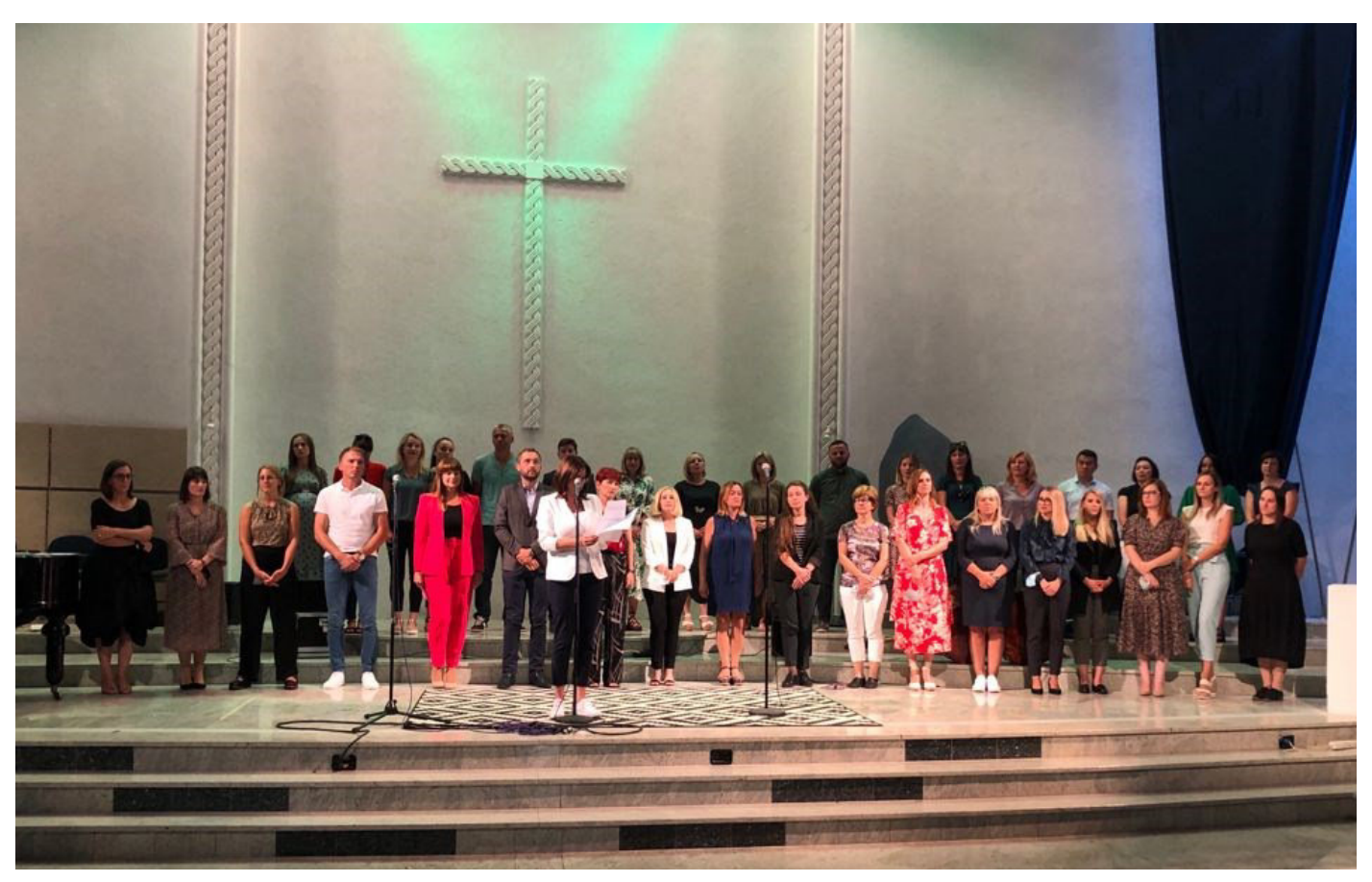
Introduction of the teaching staff